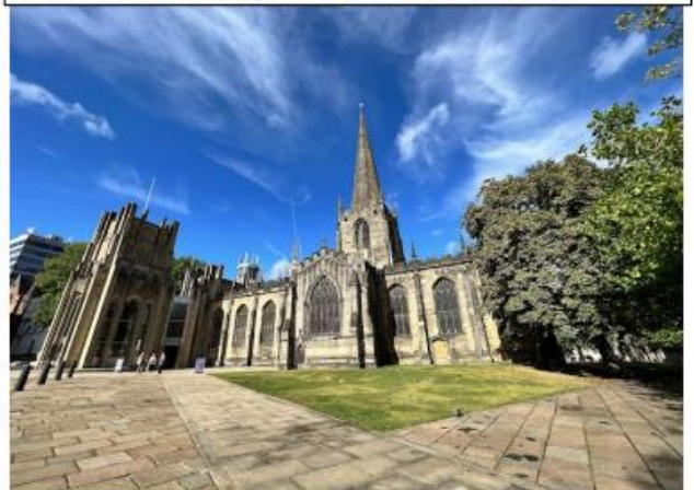
The Cathedral Church of St. Peter and St. Paul - Sheffield Cathedral - where God has been worshipped for over 1,000 years and counting.